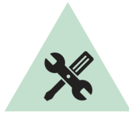
Figure 4. Technical issues.

The definition and evaluation of indicators related to the mainly technical-constructive aspects of circular actions (Figure 4) have been the main aspects investigated within the DRIVE 0 project since the first months of work (e.g., see D6.1 “Report on benchmarking on circularity and its potentials on the demo sites” 6 ).