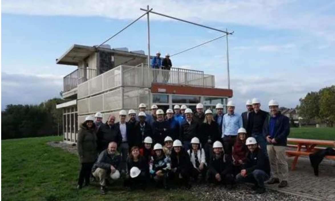
Figure 2. Consortium picture

From all these sources, a check about the different target groups' perceptions was done to reflect real concerns and obstacles to implementing a circularity strategy and even to decide to activate a deep renovation process according to a circular approach. The collected data was proven valuable for developing the DRIVE 0 suggestions and policy recommendations, ensuring that the project results have real potential to increase awareness and promote the adoption of circular measures for energy-efficient retrofitting of the existing built heritage.