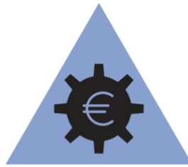
Figure 6. Financial issues.