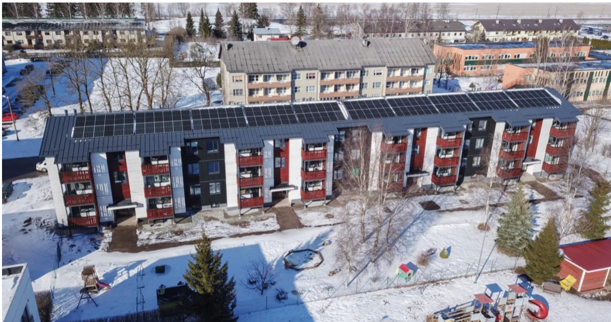
Figure 1. Estonian pilot: residential building located in Saue. General view after the deep renovation intervention based on the implementation of a circular strategy: extension of net area by closing balconies for enlarged living spaces and implementing façade additions for new balconies; energy refurbishment of the envelope through prefabricated modules with reused and recycled materials and bio-based material, and building integrated renewable energy technologies.

Therefore, accelerating the decarbonization of the built environment in all phases and components assumes a key role in achieving the energy and climate targets imposed by the European Commission to be met by 2050.