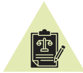
Figure 5. Regulatory issues.

In most cases, the technical issues can be resolved if a sufficient budget is available and if those involved in the process have reached a good level of awareness of the potential of adopting circular strategies for deep renovation interventions. On the contrary, several legislative aspects (Figure 5) can hinder this process and are more difficult to overcome as they depend on higher-level governmental and legislative factors. They relate to the nature of the building being renovated but also to the general regulatory framework that governs the context in which it is located.